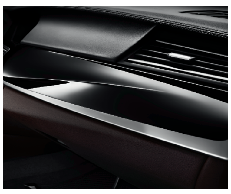
BMW Individual interior trim in Piano Finish Black.