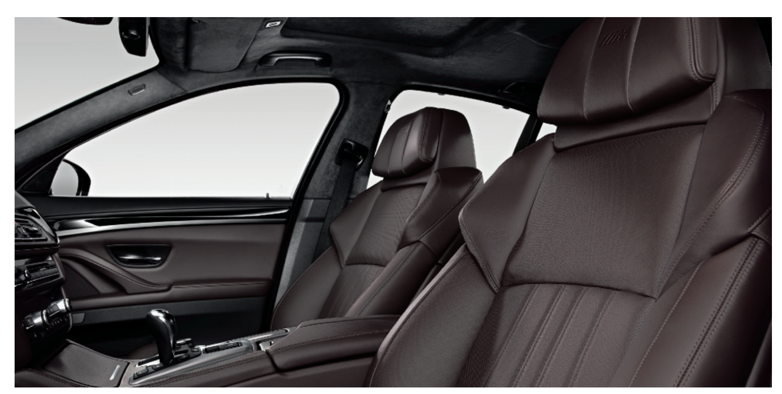
Extended fine-grain Merino leather trim Cohiba Brown with roofliner Alcantara Anthracite.